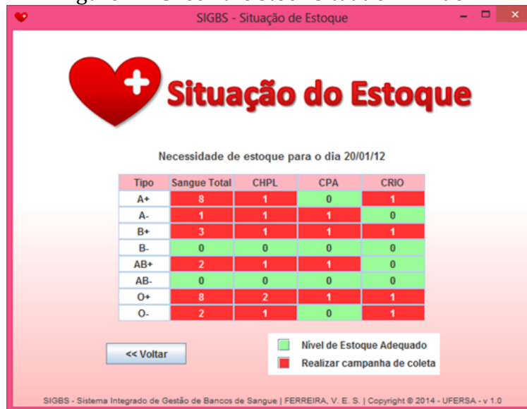
Figure 2 – Check the stock situation window.

The system sets the amount of blood bags to be collected according to the projected stock. For example, a bag of each product Platelet Concentrate (CP), red blood cells (CH), Plasma Fresh (PF) and concentrate Red blood cells Pediatric (CHP) are generated from a Whole Blood bag, requiring only the presentation of the total amount of blood bags to be collected.