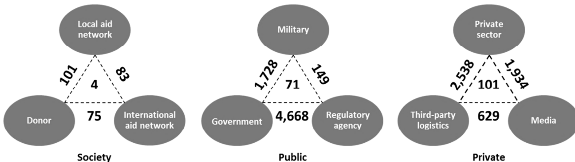
Figure 2 - Publications scenario on the interrelationship between stakeholders in each group

In evaluating the publications related to explicit intrarrelationships among stakeholders within each group, as presented in Figure 2, it can also be observed the lack of interest in the economy of the aid alleged by Olsen et al. (2003), due to the low number of publications among all stakeholders of the group 'society' in comparison to the other two groups. In the public group, there is a large number of publications between Government and Regulatory agency, which can be explained by the fact that in some countries the Government directly regulates some private sector infrastructure; and a low number of publications that relate stakeholders Military and Regulatory agency which is due to the different dimensions in which both act in humanitarian operations: the first working in practical actions guided by the Government and the second in the conditions guided by government on the practical relations between the private group stakeholders. Finally, in the private group, there is only a low interest among the publications of Media and specifically Third-party logistics, which can be explained by the greater interest of the media in actors from society and public groups.