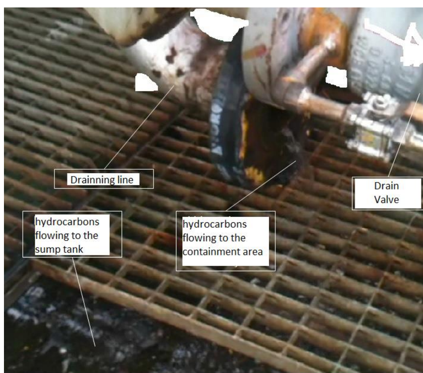
Figure 3 – Pipeline draining valve

With the removal of the drain valve, it is clear that, as shown in Figure 3, the shutoff valve does not completely halt the flow of liquid hydrocarbon through the line, allowing partial passage of the product. This passage is recurrent in the product lines, especially for those substances whose aggressiveness affects the sealing qualities of the valve seat materials. These products require a higher rate of exchange and repair of equipment, tools, and accessories.