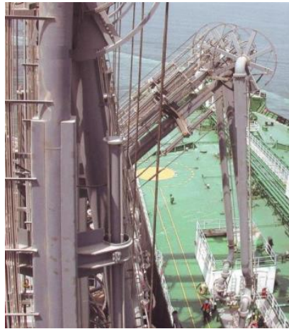
Figure 2 – Loading arm in operation

Since BC is connected to the ship's tank flange as Figure 2 below, the arm is free to follow the natural movement of the ship moored to the cradle, as shown in figure 2.